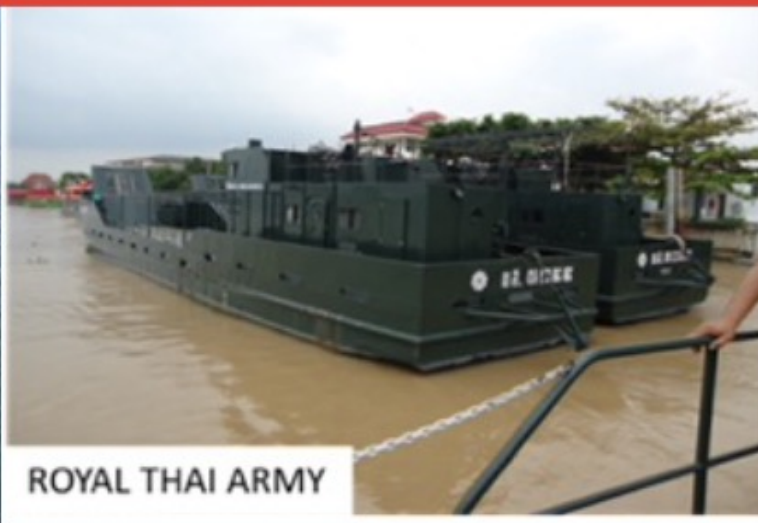
ROYAL THAI ARMY