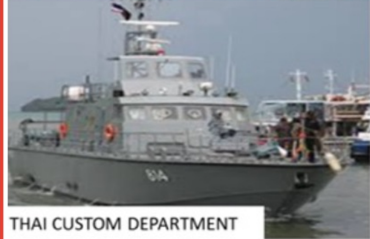
THAI CUSTOM DEPARTMENT