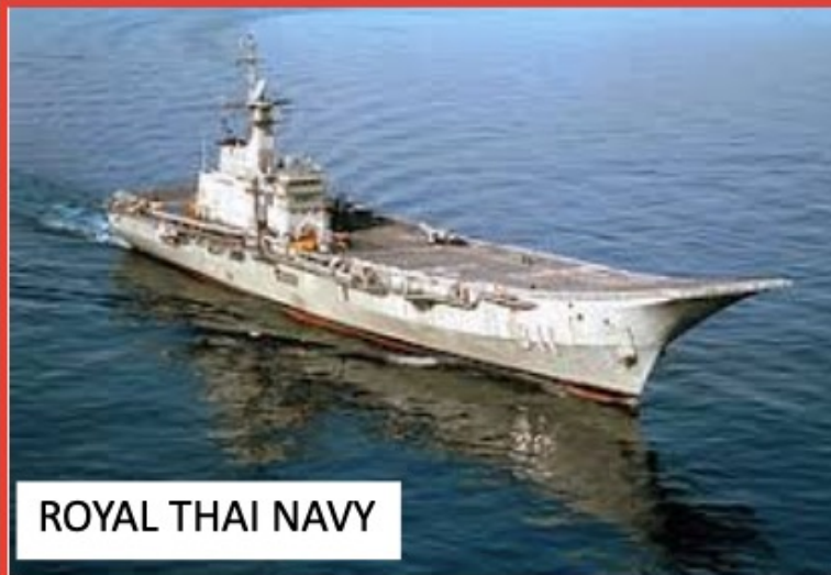
ROYAL THAI NAVY

The Bangkok Dock Provides the best ship repair & maintenance services to various customers segment such as Royal Thai Navy , government agencies and the private sector