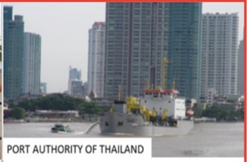
PORT AUTHORITY OF THAILAND