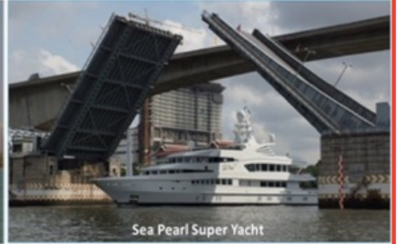
Sea Pearl Super Yacht