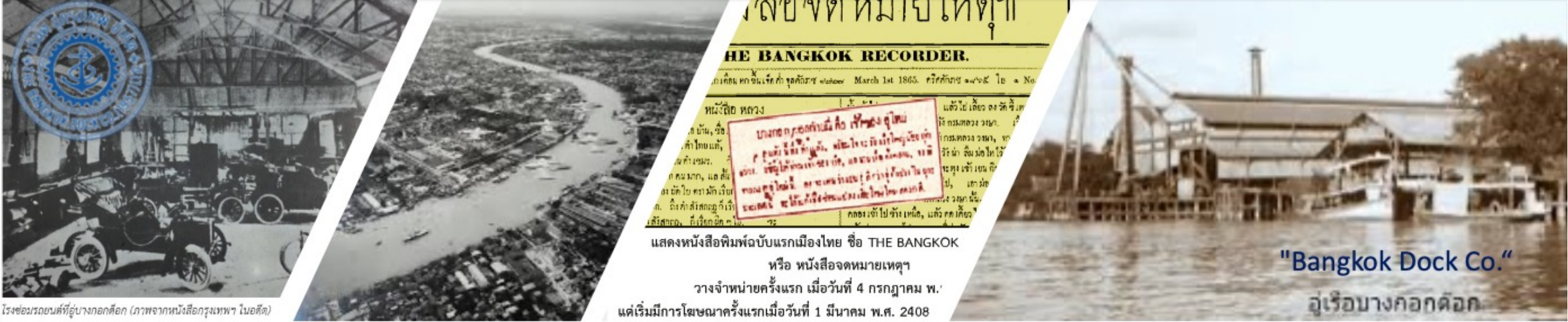
โรงซ่อมรถยนต์ที่อู่บางกอกค็อก

THE BANGKOK RECORDER. March 1st 1865. หน้า ๑๕